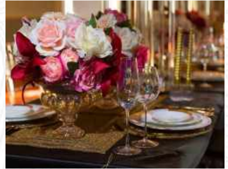
TABLE SET UP